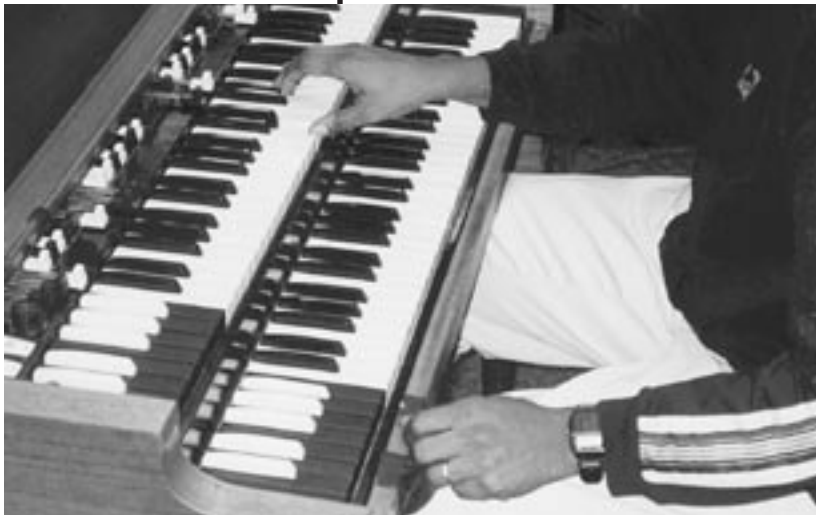
Fig. 35. Leslie speed switching with the left hand

Work with your right hand only at first to hear the effect. Add your left hand after you get a feel for it. Remember that one of the most sought-after effects on the organ is the Leslie in transition between speeds. Experiment with speed switching at dynamic changes, section changes such as verse-to-chorus or vice versa, at the high point of a solo, or at the beginning or end of a solo section.